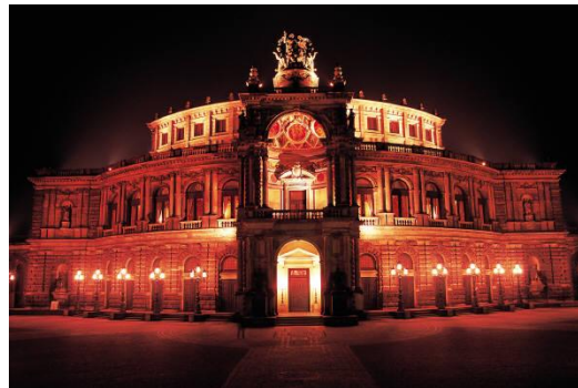
SEMPEROPER DRESDEN GERMANY

A quote that children's TV host, Mr. Rogers, always carried in his pocket.